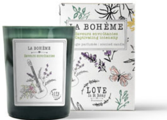
Made in Provence, France - Weight 6,3 Oz

The candle, L'AMOUR, is the memory of a caress, the scent of happiness, the reminder of an ever-deepening and timeless adoration. Its orange blossom and jasmine bouquet symbolises purity of emotions and recalls the Provençal gardens in full fragrance at the approach of summer.