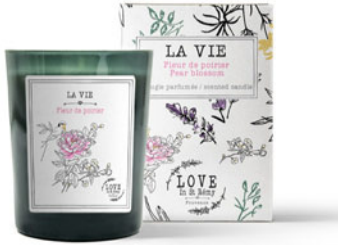
Made in Provence, France - Weight 6,3 Oz