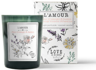
Made in Provence, France - Weight 6,3 Oz

The candle, LA VIE, is an ode to simple pleasures, to the sweetness of life, a hymn to spring. Its pear flower fragrance evokes the blooming orchards that brighten the Provençal countryside as winter finally releases its frozen grip.