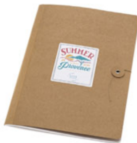
8,28 x 11,69 inch