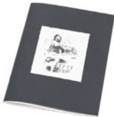
5,90 x 8,28 inch

The cover and pages are made of 100% recyclable paper. 56 plain pages. Made in Provence, France