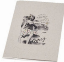
5,90 x 8,28 inch